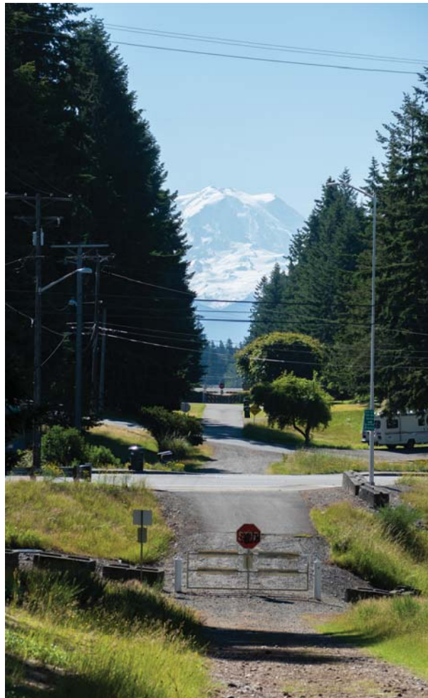
The view from Half Dollar Park looking southeast—as the Pipeline Road crosses South Hill.

The big picture, after all the planning and construction stages are complete, is to have a continuous system of trails connecting Commencement Bay to Mt. Rainier.