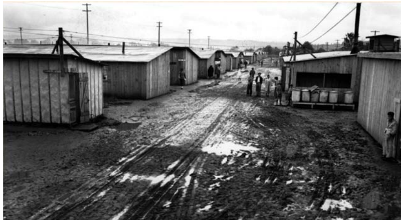
A muddy walk between barracks to access facilities such as mess hall and bathrooms at Camp Harmony.

carry; I wanted to take my kitten Fluffy and a favorite doll and blanket — but no pets were allowed. I never saw my kitten again — heartbreaking for a child. The FBI took my grandfather in the middle of the night—no explanation he did absolutely nothing wrong. He was very active in the Tacoma Buddhist Church. Grandmother cried for two weeks straight. The FBI forcefully took church leaders, teachers, preachers, and leaders in the community from their homes.”