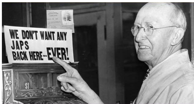
Many average Americans turned bitter towards returning Japanese detainees at war's end, such as this Fife barber.

From the Puyallup Assembly Center, the Japanese were transported on trains, with shades drawn, not knowing where they were going, for a three-day ride to permanent facilities at Minidoka, Idaho.