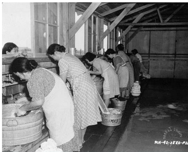
Doing laundry while detained at the "Puyallup Assembly Center."

pared. "They could only take what they could carry. They had to bring their own linen, towels etc., eating utensils, [but] no knives or chop sticks (possible weapons)— imagine what you had to leave behind, heirlooms, family chests, etc."