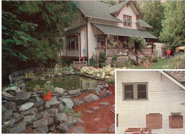
The old Lester farmhouse restored, top. House being moved to Thorpe's property.

The charming old house now restored and beautifully landscaped has been featured twice in The Puyallup Herald . It stands as a treasure to a time past on old South Hill. Thanks to the hard work of the Thorpe's, it's good for another 100-plus years.