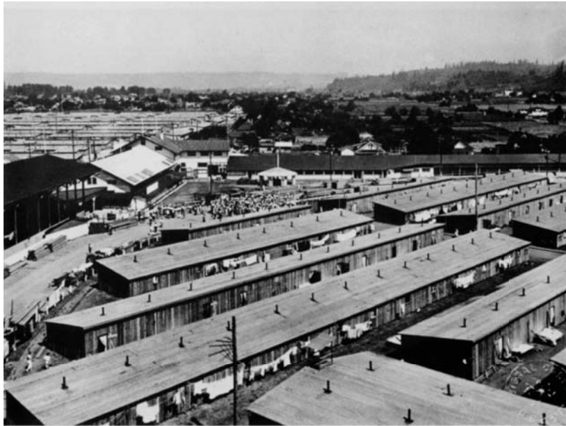
View from the Puyallup Fair grandstand looking east in 1942 shows the barracks continuing onto fair parking lots.

we made it farmable, cut down the trees, drained and leveled it and established irrigation systems. The land was virgin with rich soil that grew really good vegetable crops."