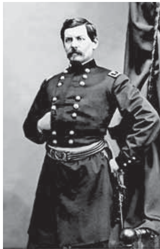
Civil War General George McClellan

General Philip H. Sheridan fought in the Yakama Indian wars as a young lieutenant; William Tecumseh Sherman also fought in the Indian wars here. Ulysses S. Grant was former quartermaster captain at Vancouver. George McClellan explored for a northern transcontinental railway path across the Cascades. On the Confederate side, George E. Pickett, was onetime commander in the San Juan Island "Pig War."