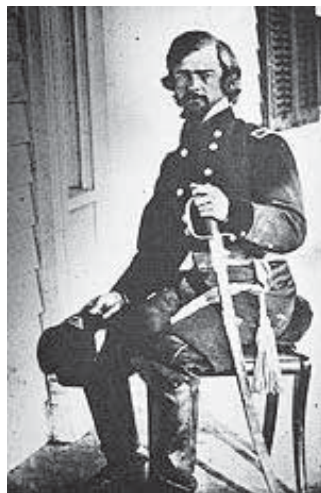
Washington Territorial Governor Isaac Stevens

Washington's first Territorial Governor, railroad engineer and Indian agent, Isaac I. Stevens, was killed at the battle of Chantilly in Virginia.