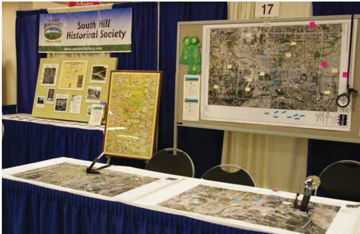
South Hill Historical Society announced their Website at the Fair www.southhillhistory