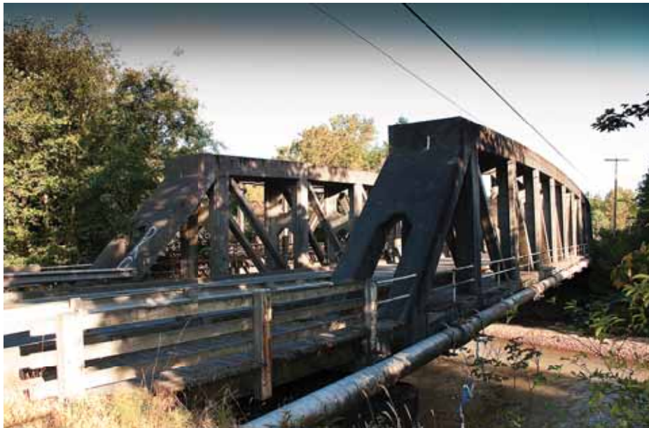
The old McMillin bridge crossing the Puyallup River, its days may be numbered

Most of us have probably crossed the old, narrow, McMillin Bridge while heading to or from Ortling. The bridge is just south of 128th Street intersection on SR162 (Pioneer Way, or the Ortling Highway for us old-timers). This intersection was once the town of McMillin. Although the bridge and the