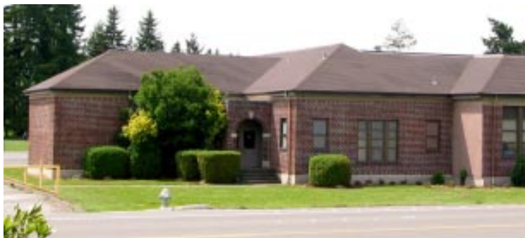
Today's Firgrove School. Right: as it appeared in 1930s

The original Firgrove School started in the early 1900s as a wooden structure east of Meridian on 136th Street (the old Patzner Road) not far from its current site. The brick building we pass on Meridian today was opened in 1935 when it replaced the original wooden schoolhouse on Patzner Road.