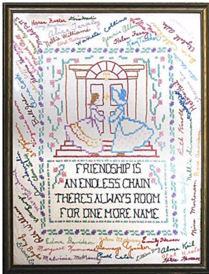
Embroidery done by the Home Crafters Club on South Hill in the 1930s

FRIENDSHIP IS AN ENDLESS CHAIN THERE'S ALWAYS ROOM FOR ONE MORE NAME