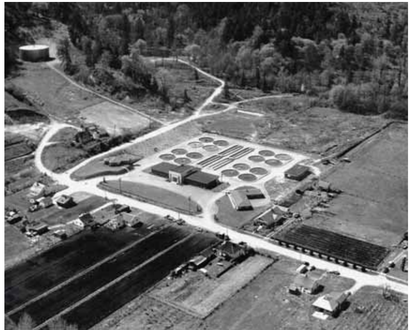
Vintage Puyallup Fish Hatchery photo — little changed today.