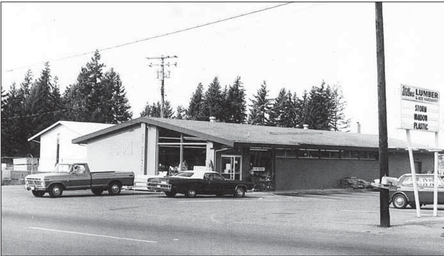
Willows Lumber expanded, moving across the street from the original site in 1974. They made the old facility into a nursery and craft store.