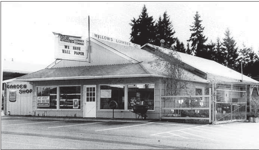
This is the original Willows Lumber, 10014, 112th St. This photo taken in the 1960s. Its location was between today's Mexican Restaurant & the Wells Fargo Home Mortgage office.