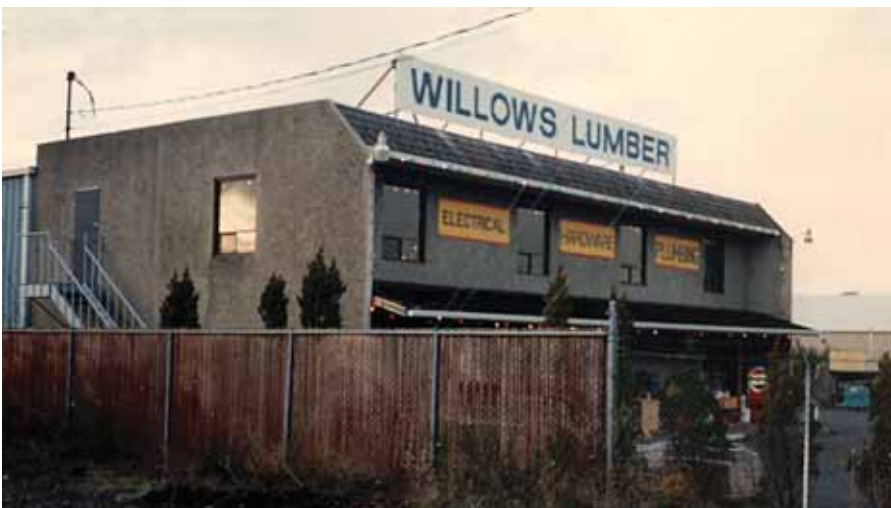
To make way for the new South Hill Mall, Willows Lumber moved to the former O'Leary Construction site, on 98th St. in 1987.