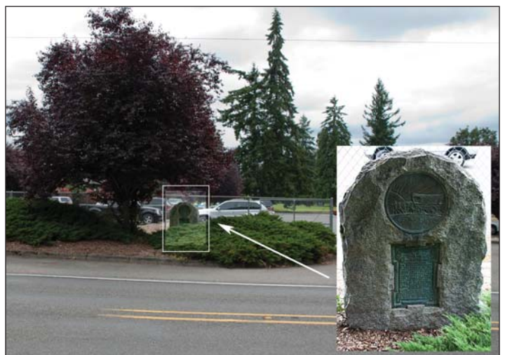
Stone monument at the entrance to Brookdale Golf Course acknowledges the Longmire-Biles encampment.