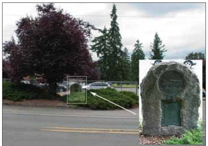
Stone monument at the entrance to Brookdale Golf Course acknowledges the Longmire-Biles encampment.