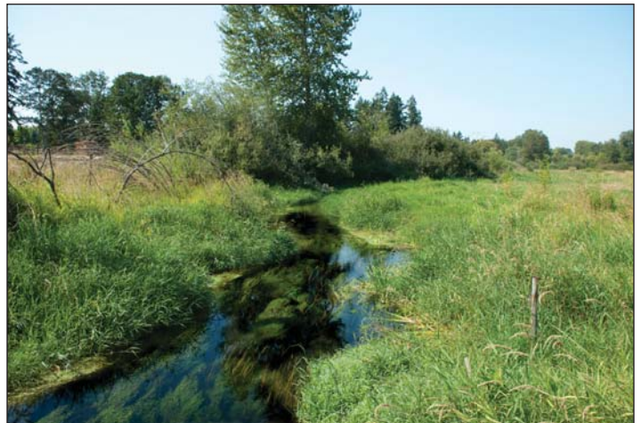
Clover Creek seen today from Waller Road as it enters Brookdale Golf Course.

From this last camp the Longmire-Biles pioneers spread far and wide—most never to meet again. They looked for and found land to homestead and fulfill their dreams of a better life.