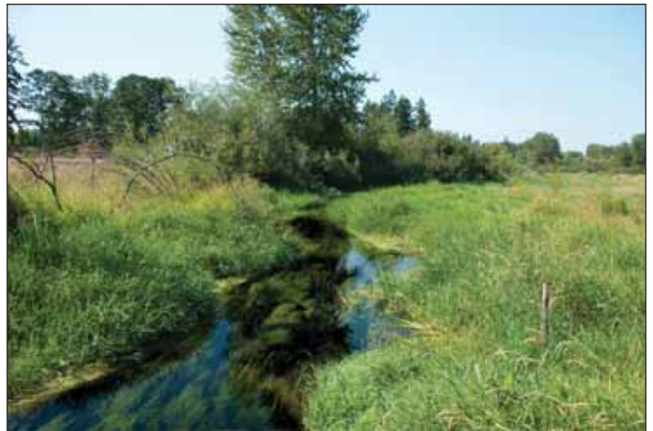
Clover Creek seen today from Waller Road as it enters Brookdale Golf Course.