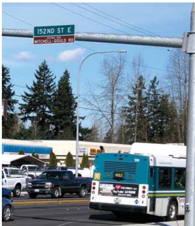
Today's busy intersection of 152 ND ST E (Mitchell-Gould Road) and Meridian.