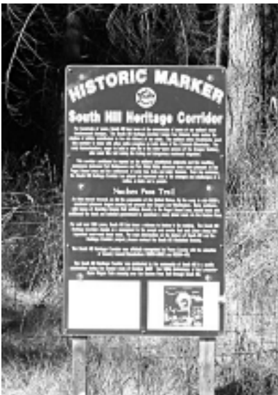
One of five interpretive signs showing the location of the Naches Trail/North branch of the Oregon Trail on South Hill.

So, in summary, a number of accomplishments of the Society can be reported. It is important to gather as much data as possible for additional reporting.